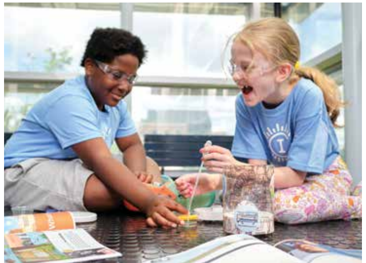
The Operation: HydroDrop experience at Camp Invention.

All local Camp Invention programs are facilitated and taught by qualified